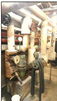
Part of the heating system in need of renovation

In the last newsletter I mentioned that the heating system needs 'surgical' treatment. We were supposed to start taking care of the system in the fall but for technical reasons the matter was postponed and it was decided to start the procedure after the winter months so as not to shut down the heating system when most needed. Looking back, the delay turned out for good because in the meantime we were able to examine other alternatives to upgrade the system. Lord willing, we will begin the renovations in the coming weeks. The maintenance team would very much value your prayers for the Lord's help and guidance as they work.