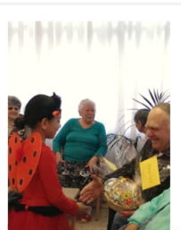
Volunteers' trip to the Negev