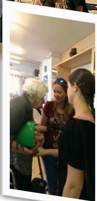
Fellowship with the 'Lech Lecha' group

In the last newsletter I mentioned that the heating system needs 'surgical' treatment. We were supposed to start taking care of the system in the fall but for technical reasons the matter was postponed and it was decided to start the procedure after the winter months so as not to shut down the heating system when most needed. Looking back, the delay turned out for good because in the meantime we were able to examine other alternatives to upgrade the system. Lord willing, we will begin the renovations in the coming weeks. The maintenance team would very much value your prayers for the Lord's help and guidance as they work.