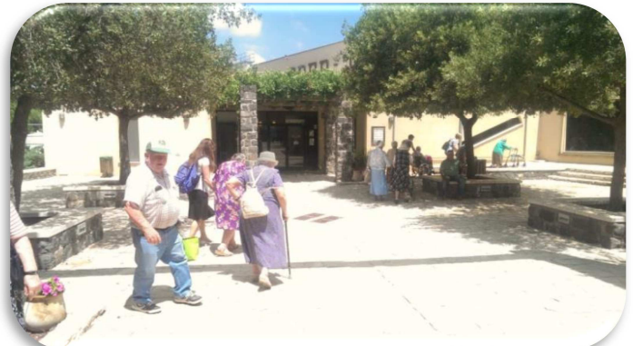
Residents' trip to the Marzipan Museum - Kfar Tavor

During the past six months the architect, who is a professional in the area of planning and designing of Senior Citizens' Homes, worked on an initial model of the building design. The supposed model of the upgraded building was presented in a meeting with the preservation department of the Haifa Municipality (in the picture below). The objective was to make sure that the building design would integrate in the German Colony. One of the demands, for example, is to coat the building with stone. We thank the Lord for a fruitful meeting that was held in a positive spirit. At the moment, the plans are being examined by the legal department of the Haifa Municipality and we hope that they will see our need and approve our request.